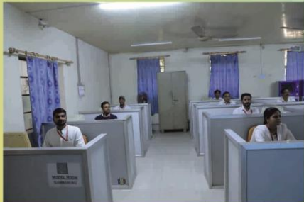
COMMERCIAL MODEL ROOM