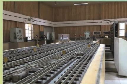
TRANSPORTATION MODEL ROOM